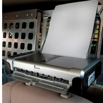
Canon iP100 VHPM