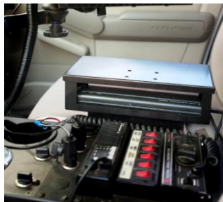
Brother PocketJet BPJ-VHPM