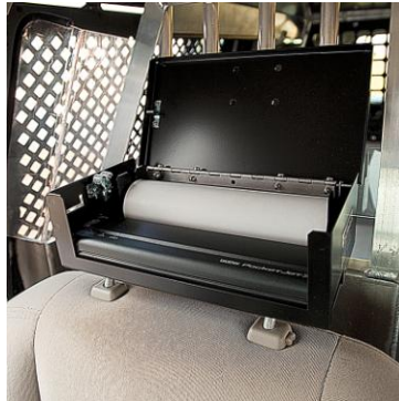
BPJ-VHPM (Paper Loading Position)