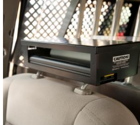
Brother PocketJet BPJ-VHPM