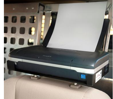
Ready to print

Patented product (U.S. Pats. 7637566, 7874612, additional patent pending)