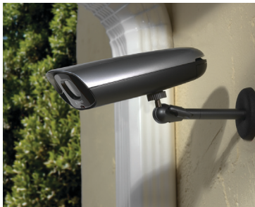
On the wall