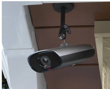
Under a soffit