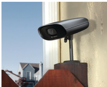
On a post